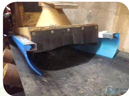
Snap-Loc skirting in FRAS formulation